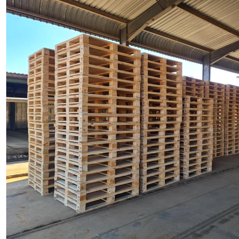
New Pallets Supply to production plant