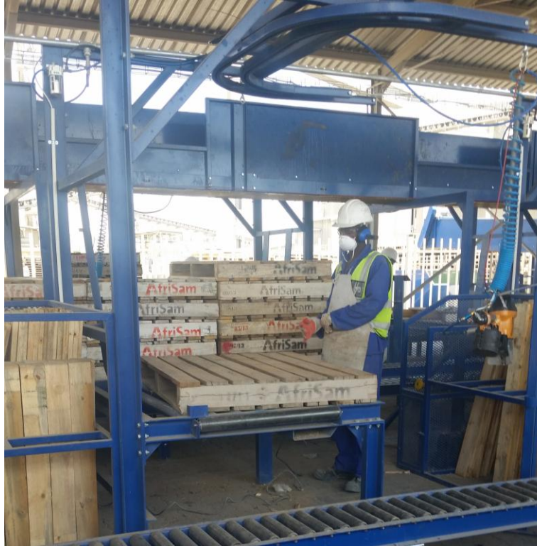
Pallet Inspection and Repairs at the Client's Facility